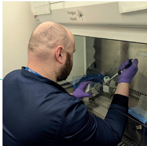
A researcher testing a sample from a patient with CLAD

● Organ rejection after a transplant affects between 20–30% of patients in the first few months and sadly can lead to death. One cause of a rejection of a lung transplant is CLAD (Chronic Lung Allograft Dysfunction). We funded Consultant in Respiratory and Transplant Medicine Professor Anna Reed's research into CLAD to help patients with lung transplants live longer.